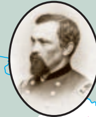
Gen. August V. Kautz