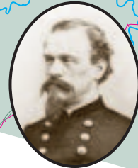
Gen. James H. Wilson