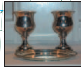
This communion set was stolen by the raiders from St. John's Church and recovered days later at Ream's Station.